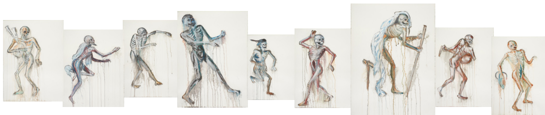
Danse macabre, 2011, watercolour and mixed media on paper

No dramatization but a stratified mirror representing social classes like layers of paint highlights. The scene and the paper are as if corrected, as white as a white cube. The printed surface work functions as an indented impression of life, a mirror in the reflected form of Death. This new work by Hervé Bohnert allows us to glimpse a round of life while emphasizing its inanity through the disturbing strangeness of words, in a position to have fun and dance like any living person. Delivered from any agreed and expected message, Hervé Bohnert presents us with a radical work. A violently contrasting vision, relieved of the consolations of the other world: "God is not with us," he writes in a way that is as desperate as it is jubilant.